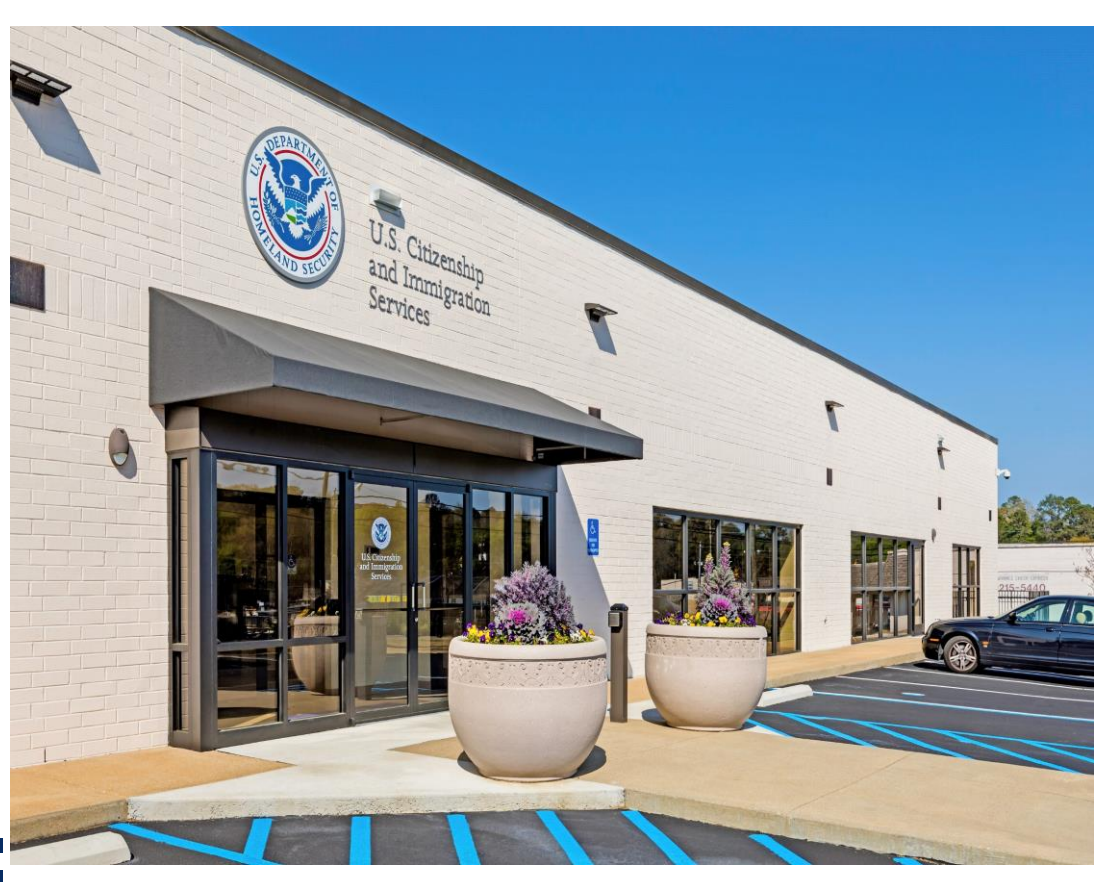
USCIS MONTGOMERY, AL - LEED CERTIFIED BUILD-TO-SUIT 21,400 SQ.FT.